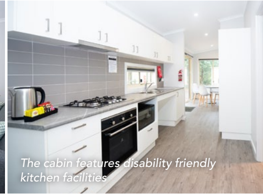
The cabin features disability friendly kitchen facilities