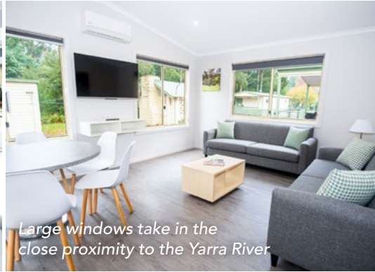
Large windows take in the close proximity to the Yarra River